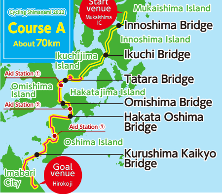
For further details, please check the Cycling Shimanami 2022 official website. https://cycling-shimanami.jp/