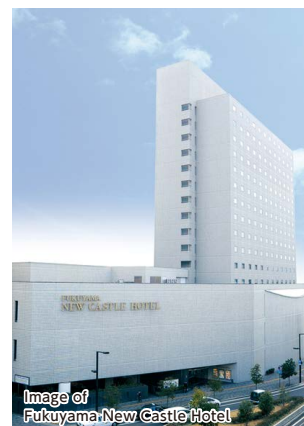
Image of Fukuyama New Castle Hotel